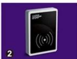
2 RF Card Reader