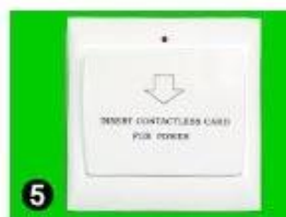
5 Gain Power Switch