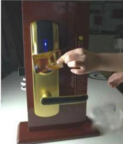
opening the door with RF card