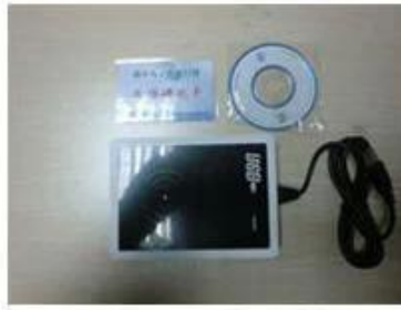
RF card reader (used for issuing room card to guests)