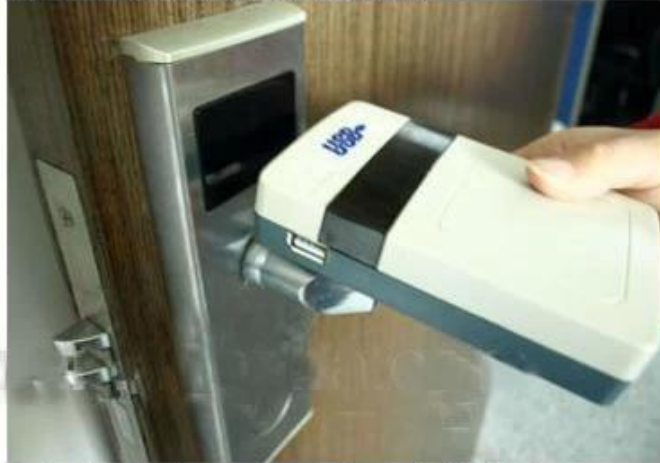
collect opening records from hotel lock

High security hotel keycard lock factory