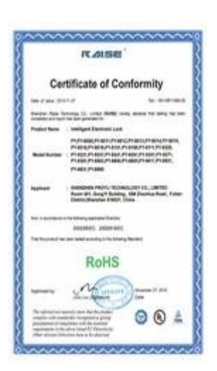
Some Other Pictures of our product