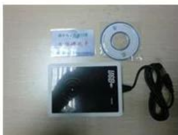
RF card reader (used for issuing room card to guests)