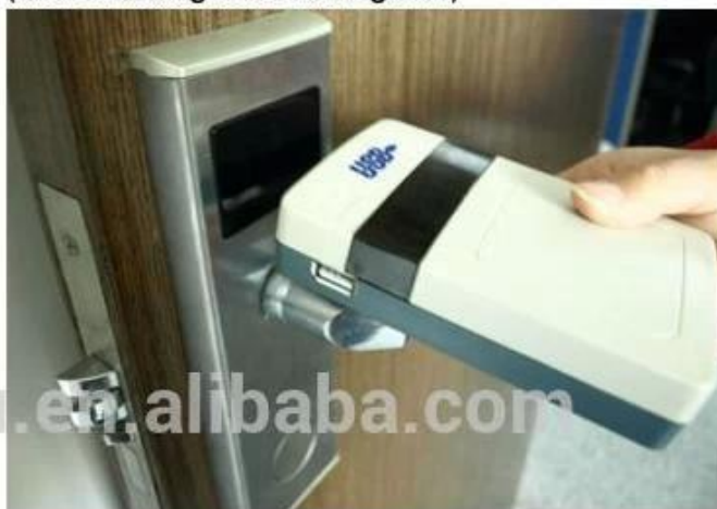
collect opening records from hotel lock