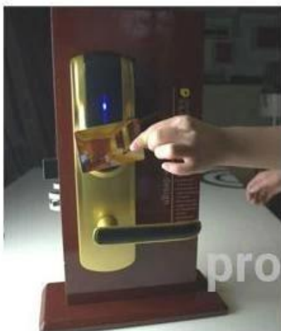
opening the door with RF card