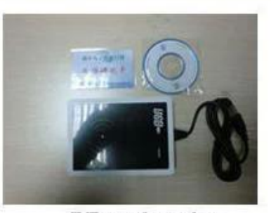
(used for issuing room card to guests)