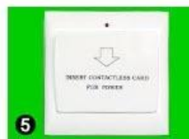
5 Gain Power Switch