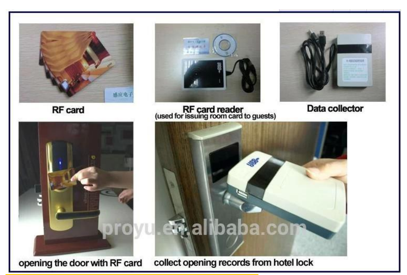
shenzhen Temic card company, Guangzhou Temic card company