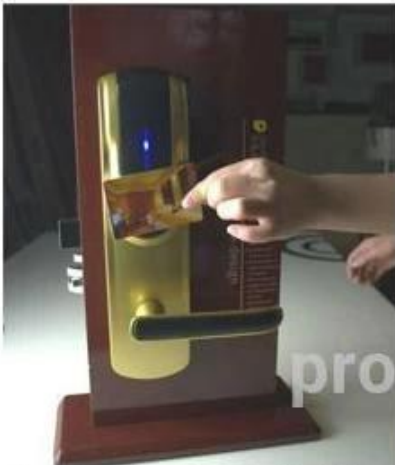
opening the door with RF card