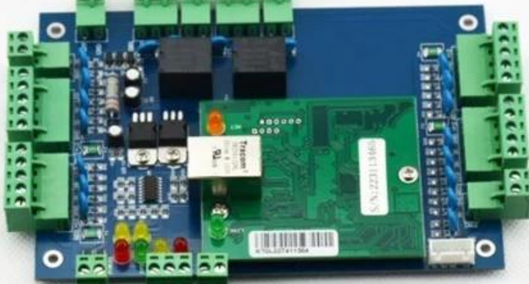
Double door bidirection