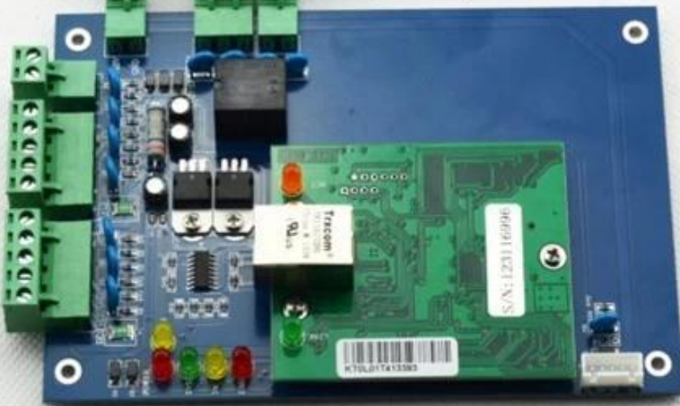
Single door bidirection