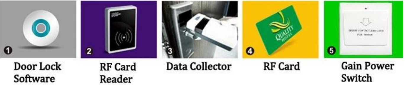
1 Door Lock Software