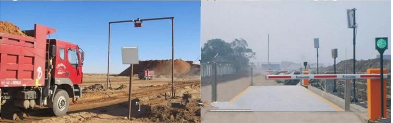
uhf rfid reader module price read other UHF cards