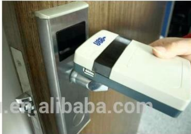
collect opening records from hotel lock