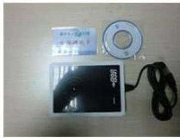
RF card reader (used for issuing room card to guests)