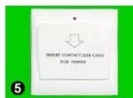
5 Gain Power Switch