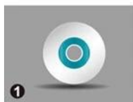
1 Door Lock Software