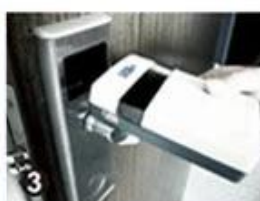
3 Data Collector