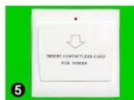
5 Gain Power Switch