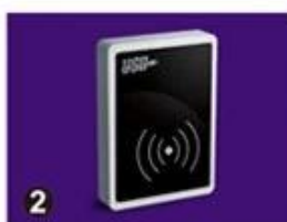
2 RF Card Reader