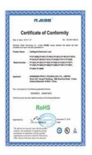
Some Other Pictures of our product