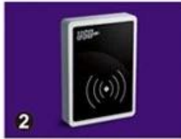
2 RF Card Reader