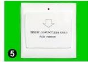
5 Gain Power Switch