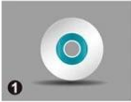
1 Door Lock Software