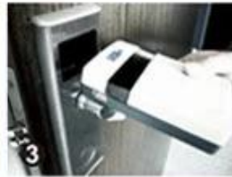
3 Data Collector