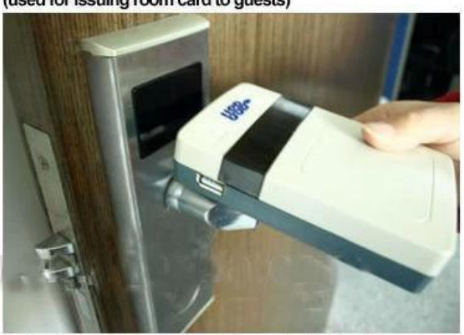
collect opening records from hotel lock