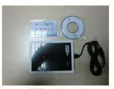
(used for issuing room card to guests)