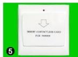
5 Gain Power Switch