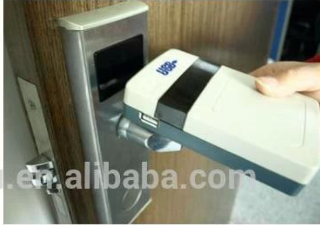
collect opening records from hotel lock