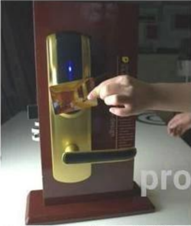
opening the door with RF card